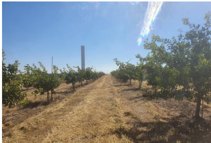
Figure 2: Pistachio plantation in July 2022. In the background are the electricity turbines under construction (and a broken camera stain).

During the summer of 2021, we had to relinquish all the male trees and three female trees in each row on the western side for an electricity turbine which was being built just a few meters from the plot (i may prove how windy this site is). See the attached photo in Figure 2 from July 2022 (the stain in the center is a fracture in the lens coverage on the cellphone). The plantation is presented at its best.