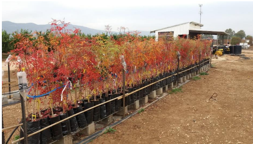
Figure 1: Our nursery of 8 months old UCB1 rootstocks, ready for winter planting.